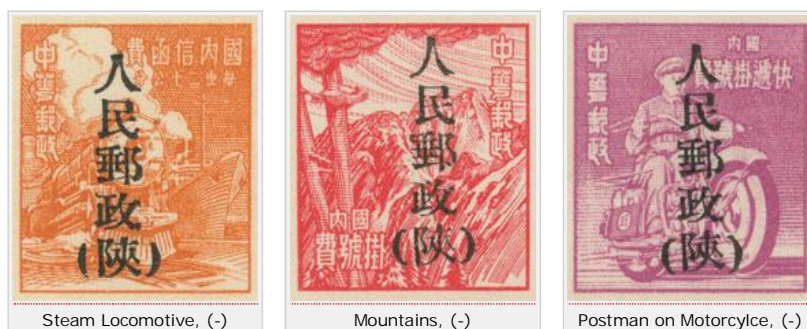
Steam Locomotive, (-)