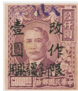
Dr. Sun Yat-sen, 1/6000 元 (Type A)