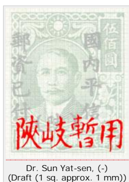
Dr. Sun Yat-sen, (-) (Draft (1 sq. approx. 1 mm))