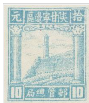
Pagoda Hill (延安宝塔山) (ak), 10 元 (Type c)