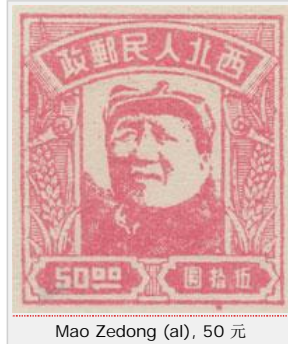
Mao Zedong (al), 50 元

Regular Issue: Mao Zedong and Great Wall Issue (1949)