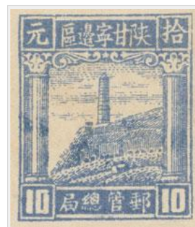
Pagoda Hill (延安宝塔山) (ak), 10 元 (Type b)