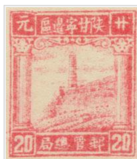
Pagoda Hill (延安宝塔山) (ak), 20 元