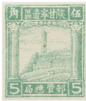
Type A, Error (misprint)