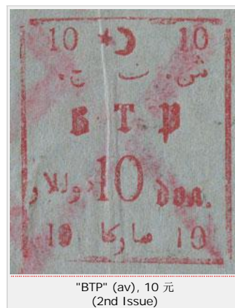
"BTP" (av), 10 元 (2nd Issue)