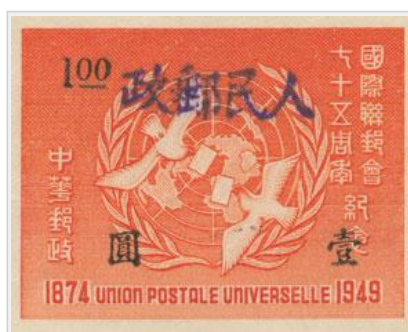
Doves and Globe, 1 元 (Type C)