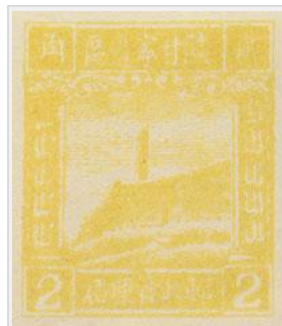
Pagoda Hill (延安宝塔山) (ak), 2 角