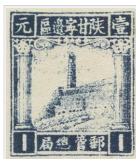
Pagoda Hill (延安宝塔山) (ak), 1 元 (Type b)