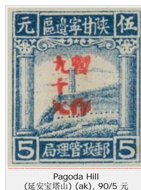
Pagoda Hill (延安宝塔山) (ak), 90/5 元

Metal Chop (No. 4 "Song Ti (宋体)" font style), large "圓"