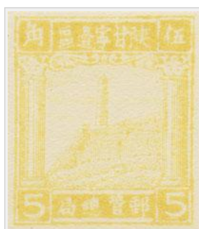
Pagoda Hill (延安宝塔山) (ak), 5 角