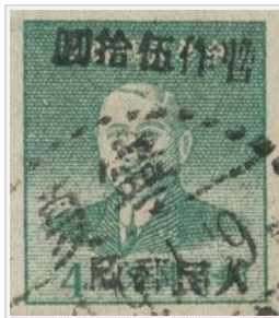
Dr. Sun Yat-sen, 50/4 元