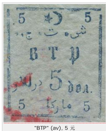
"BTP" (av), 5 元

Revenue Stamp: "BTP" ("Восточно-Туркестанской Республики") Issue (1945)