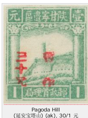
Pagoda Hill (延安宝塔山) (ak), 30/1 元

Metal Chop (No. 5 "Song Ti (宋体)" font style), small "元"