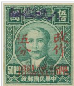
Dr. Sun Yat-sen, 5/500 分 (Type B)