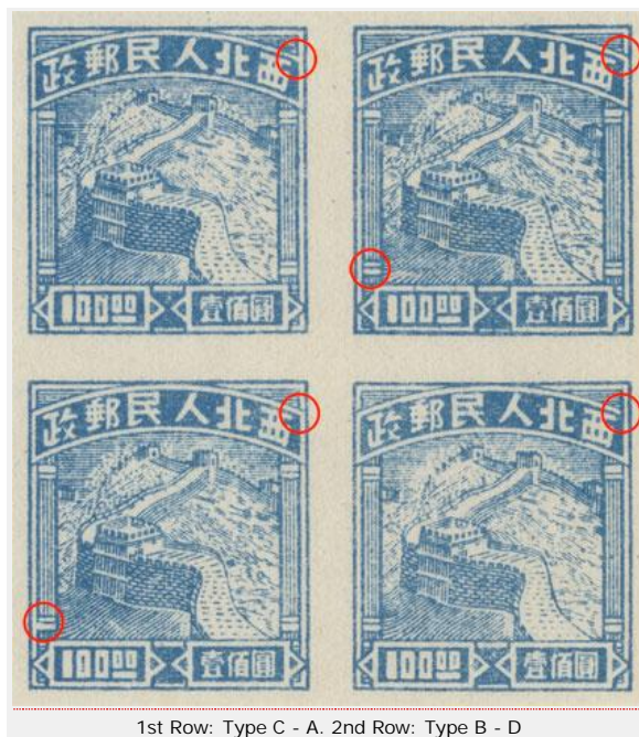
1st Row: Type C - A. 2nd Row: Type B - D