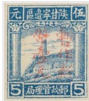
Pagoda Hill (延安宝塔山) (ak), 1/5 元