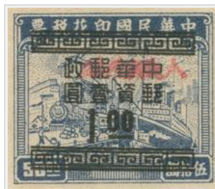
Sea, Land and Air Transportation, 1/50 元 (Type D)