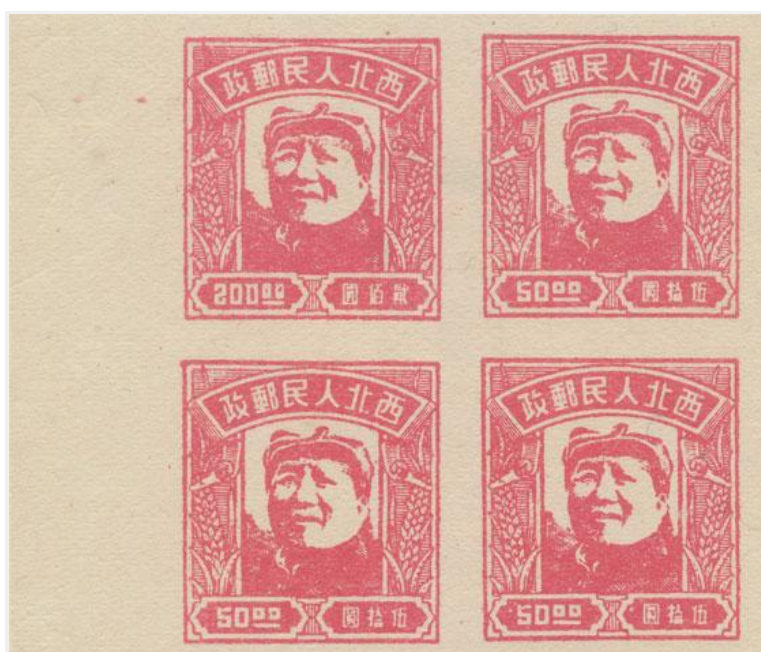
200 元, misprint. The cliché for this sheet is 8 x 5 = 40 stamps, so this error can be found four times in a sheet at pos. 33, 41, 113 and 121.