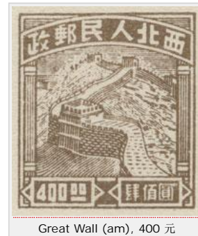
Great Wall (am), 400 元