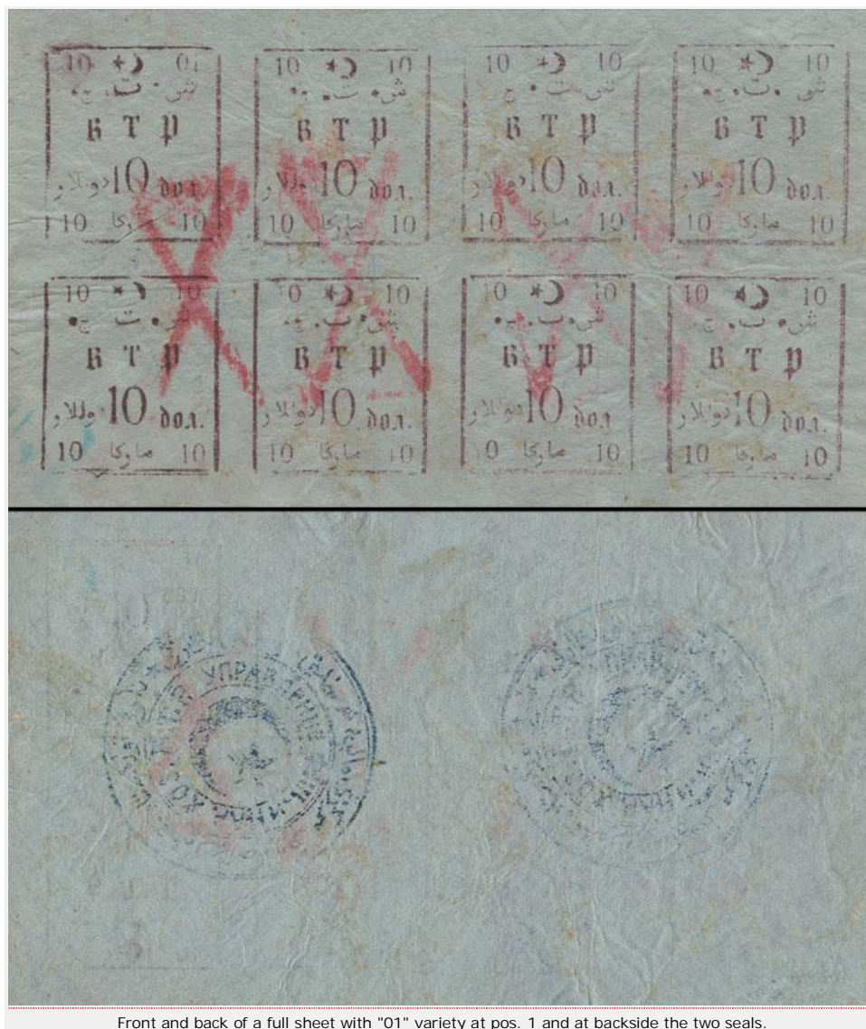
Front and back of a full sheet with "01" variety at pos. 1 and at backside the two seals.