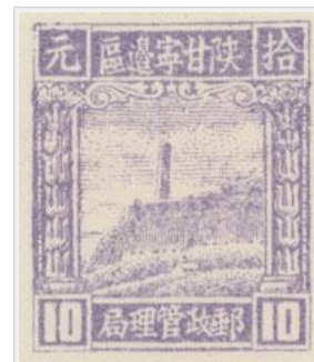
Pagoda Hill (延安宝塔山) (ak), 10 元