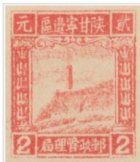
Pagoda Hill (延安宝塔山) (ak), 2 元