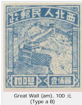
Great Wall (am), 100 元 (Type a B)