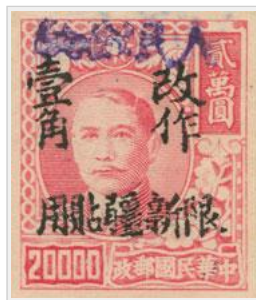
Dr. Sun Yat-sen, 1/20000 角 (Type B)