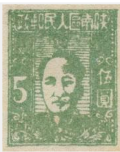
Printed on both sides