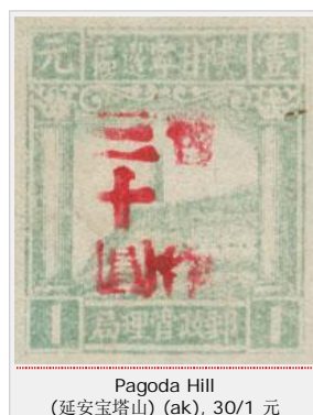
Pagoda Hill (延安宝塔山) (ak), 30/1 元

Metal Chop (No. 4 "Song Ti (宋体)" font style), large "圓"