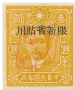
Dr. Sun Yat-sen, 3 元