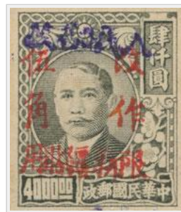
Dr. Sun Yat-sen, 5/4000 角 (Type B)