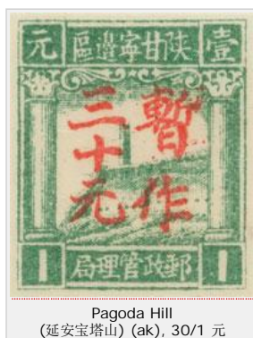
Pagoda Hill (延安宝塔山) (ak), 30/1 元

Metal Chop (No. 5 "Song Ti (宋体)" font style), small "元"