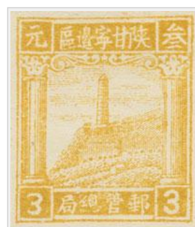
Pagoda Hill (延安宝塔山) (ak), 3 元