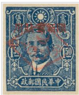
Dr. Sun Yat-sen, 1.5 元