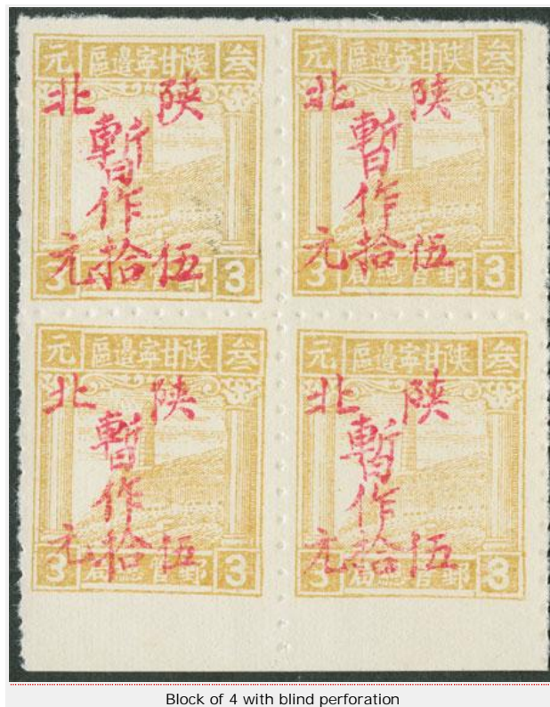
Block of 4 with blind perforation