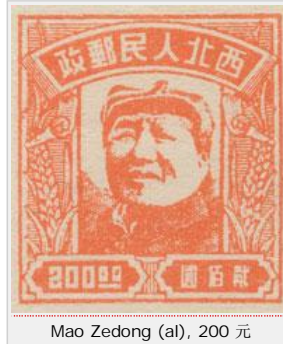
Mao Zedong (al), 200 元