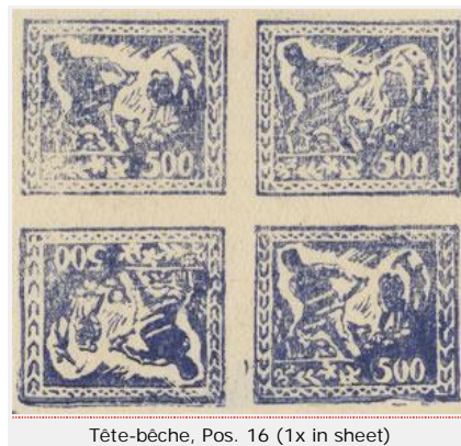
Tête-bêche, Pos. 16 (1x in sheet)