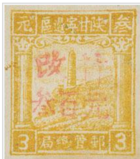
Pagoda Hill (延安宝塔山) (ak), 300/3 元 (Type a)