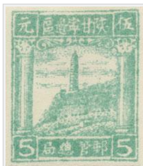
Pagoda Hill (延安宝塔山) (ak), 5 元