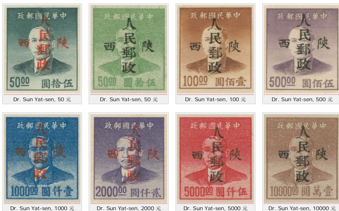
Dr. Sun Yat-sen, 50 元