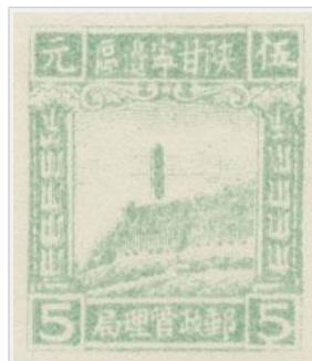
Pagoda Hill (延安宝塔山) (ak), 5 元