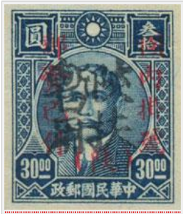
Dr. Sun Yat-sen, (-)