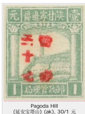
Pagoda Hill (延安宝塔山) (ak), 30/1 元