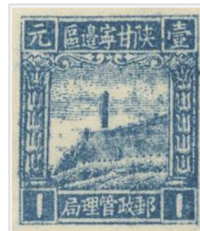
Pagoda Hill (延安宝塔山) (ak), 1 元