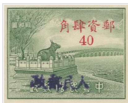
Bronze Bull, Beijing (銅牛與十七孔橋), 4 角 (Type B)