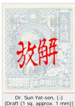
Dr. Sun Yat-sen, (-) (Draft (1 sq. approx. 1 mm))