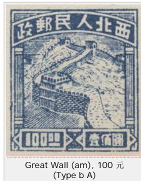
Great Wall (am), 100 元 (Type b A)