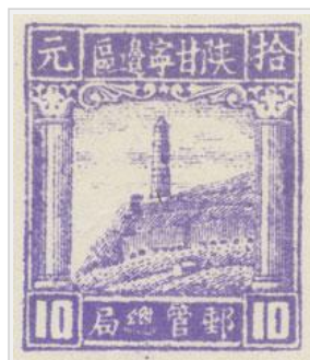
Pagoda Hill (延安宝塔山) (ak), 10 元 (Type a)