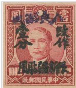
Dr. Sun Yat-sen, 1/100 分 (Type A)