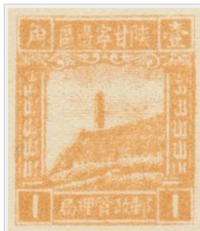
Pagoda Hill (延安宝塔山) (ak), 1 角