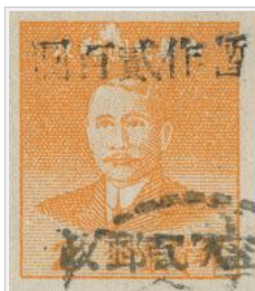
Dr. Sun Yat-sen, 200/2 元