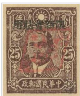
Dr. Sun Yat-sen, 25 分

Provisional Issue: Stamps Overprinted with "National Bank" in Uyghur Language (1945)