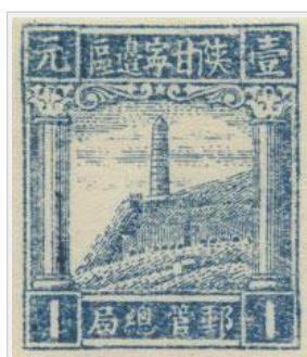
Pagoda Hill (延安宝塔山) (ak), 1 元 (Type a)