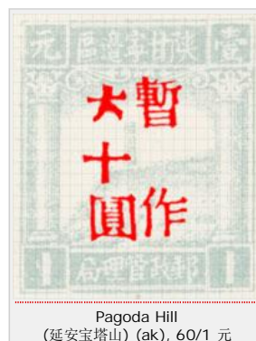
Pagoda Hill (延安宝塔山) (ak), 60/1 元 (Draft (1 sq. approx. 1 mm))