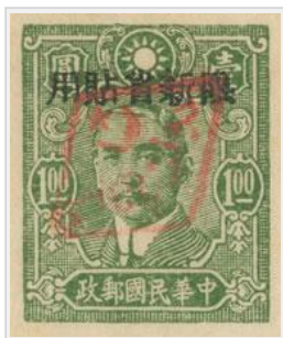
Dr. Sun Yat-sen, 1 元