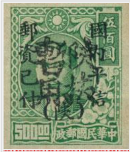
Dr. Sun Yat-sen, (-)

Provisional Issue: Shanxi Unit Stamps Overprinted with "Shan Fu Temporarily Used for" at Fufeng (1949)