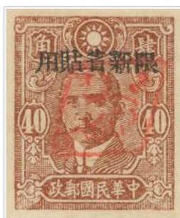
Dr. Sun Yat-sen, 40 分