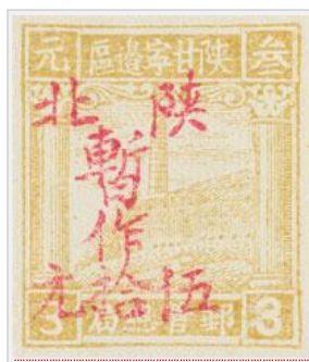
Pagoda Hill (延安宝塔山) (ak), 50/3 元

Provisional Issue: 4th Print Pagoda Hill Issue Overprinted with "North Shanxi Temporarily Used for" and Surcharged (1949)