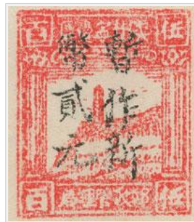
Pagoda Hill (延安宝塔山) (ak), 2/500 元