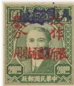
Dr. Sun Yat-sen, 3/200 分 (Type C)