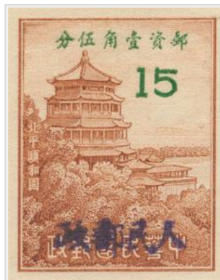
Pagoda Fu Xiang Ge, Beijing (佛香閣), 15 分 (Type B)