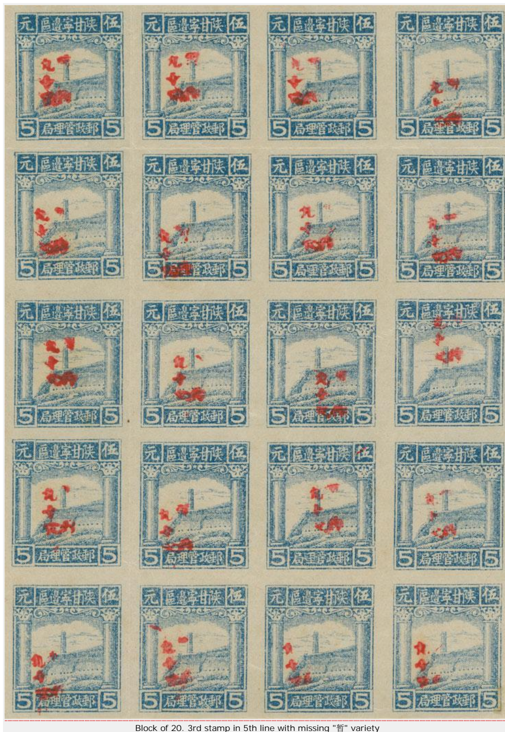
Block of 20. 3rd stamp in 5th line with missing "暫" variety