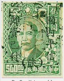
Dr. Sun Yat-sen, (-)

Provisional Issue: Shanxi Unit Stamps Overprinted with "Liberation" at Weinan (1949)