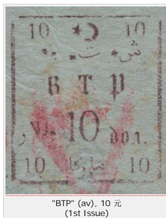
"BTP" (av), 10 元 (1st Issue)